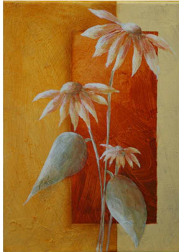
Glazed Flowers Two 9 x 12" stretched canvases painted with DecoArt Traditions. Wiped background color with flowers painted entirely in glazed colors. Hair dryers needed.