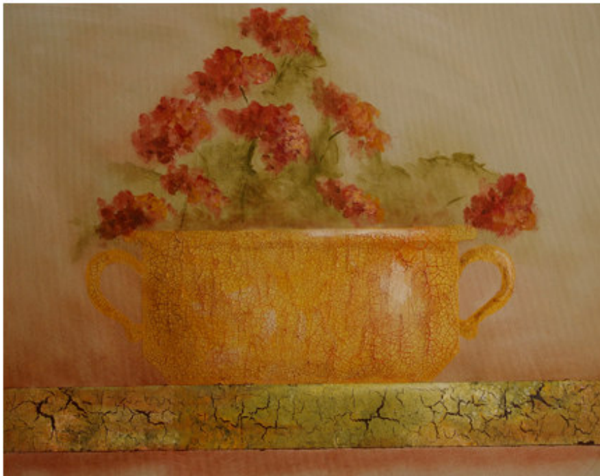
Crackled Flower Pot Jo Sonja colors with two different crackled effects and a quick and easy floral technique.