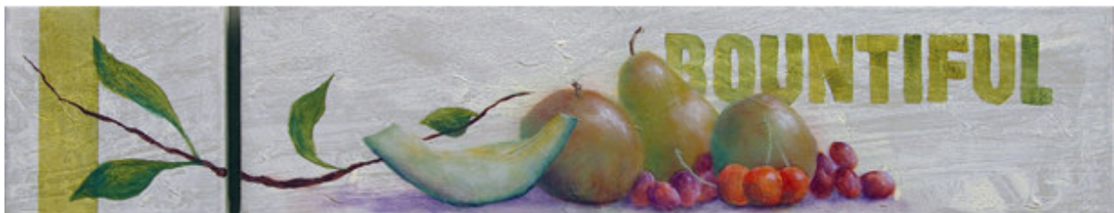
Bountiful Painted with DecoArt Traditions on two stretched canvases - 6x6 and a 6 x 24" canvas. Design is built with layers of glazed colors. Hair dryers needed.