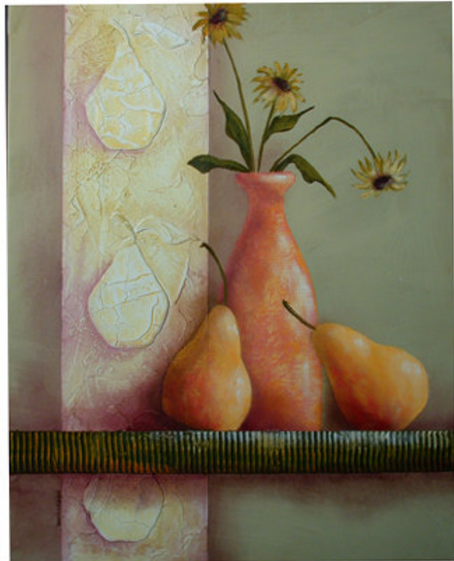
Pear Panel Painted with Jo Sonja paint on a 16x20" stretched canvas. Multiple layers of texture. Hair dryers needed. Additional $6.00 cost per student for the stencil.