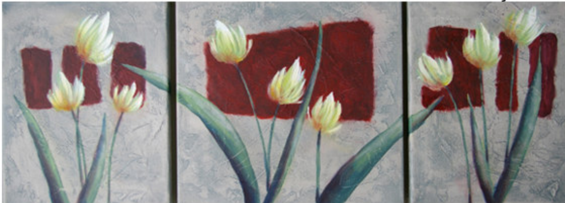
Tulip Trio Painted with DecoArt Traditions on three canvases - 9x12 and a 12 x 12 center panel. Visual texture painted dark to light.