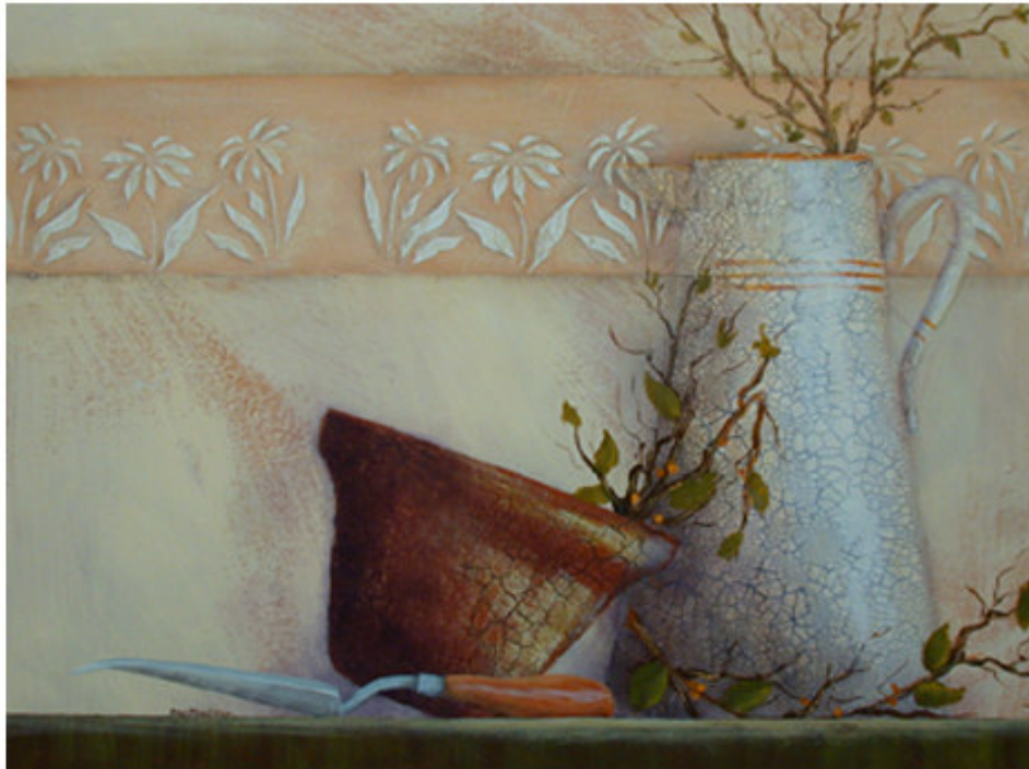
Garden Bench Painted with Jo Sonja paint on a 16 x 20" stretched canvas. Top coat crackle on the jug; raised stencil in background. Hair dryers needed. $6.00 additional cost per student for a stencil.

Bob Pennycook RR 3, 20 N. Hawkins Bay Rd. Tweed, ON, Canada K0K 3J0 bob@bobpennycook.com www.bobpennycook.com www.bobpennycook.typepad.com