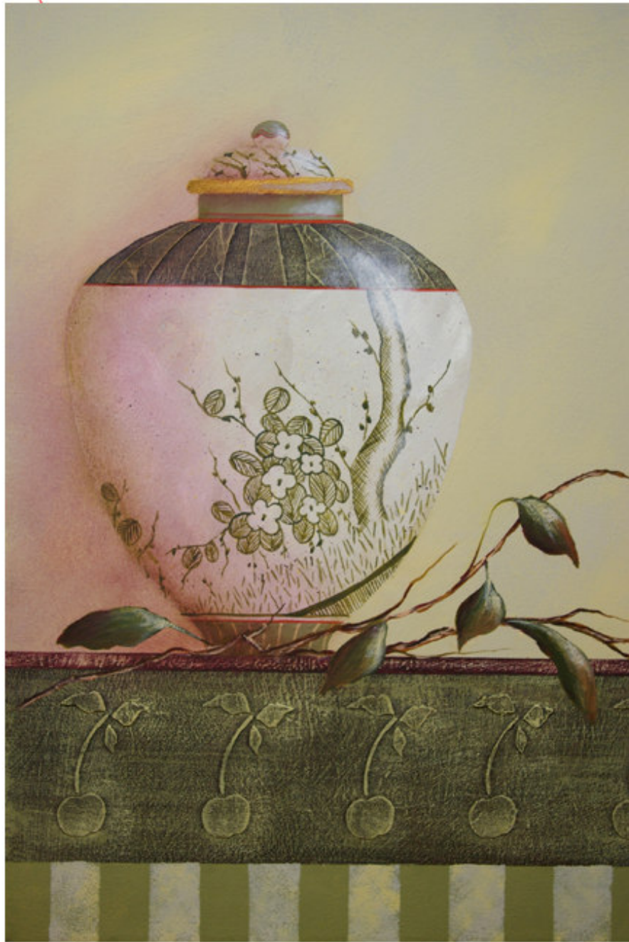
Ginger Jar Painted with Jo Sonja paint on a 16x20 stretched canvas. Raised texture on the jar and the background. Additional $6.00 cost per student for stencil.